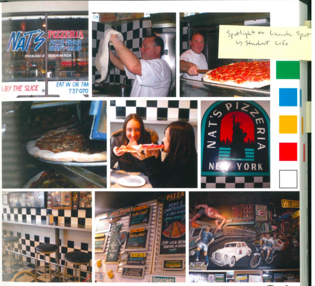
Nat's Pizza 21