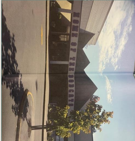
Great introductory image